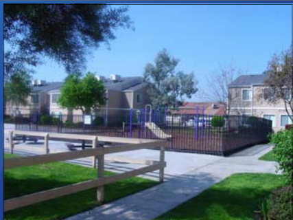
Fig Garden Terrace 7166 N. Fruit Fresno, California

Price: $ 7,350,000 #/Units: 110 Price/Unit: $ 63,042 Cap Rate: 6.60 Remarks: Assume loan